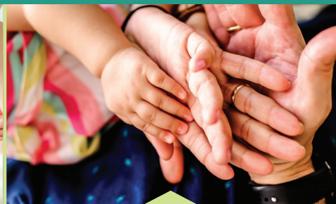
Child and Adult Group Support & Treatment