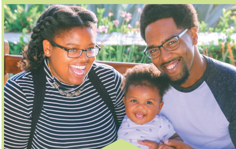
Evidence Based Child & Family Prevention and Treatment Services