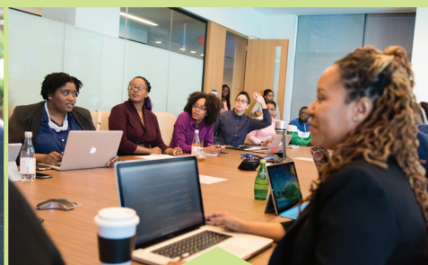
Professional Consultation and Community Education Services