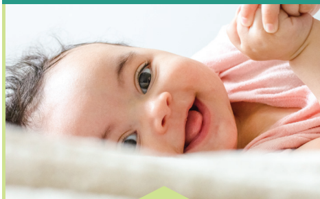
Acute Crisis Intervention and Stabilization